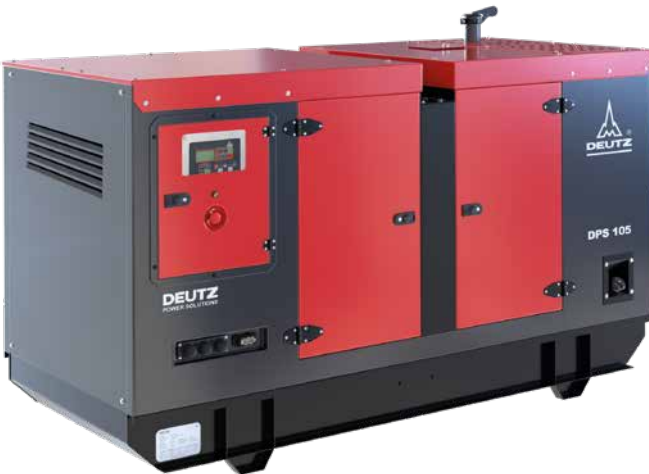
The new range of DEUTZ POWER SOLUTIONS from 13 to 500 kVA.

Complete power generator sets that are manufactured and tested by Deutz. Customers can be assured of its quality, performance & reliability. The Standard DPS package includes various features and allows customization to meet any application requirements.